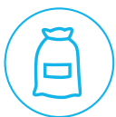
Animal Feed & Protein