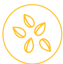
Grains & Oilseeds

We help customers around the world meet the increasing demand for food, feed & fibre, whether it's working with rice farmers in Asia, sourcing cotton in Australia, or producing value-added products in Africa, our extensive market leading portfolio enables us to achieve this.