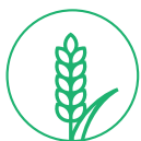
Specialty Grains & Seeds